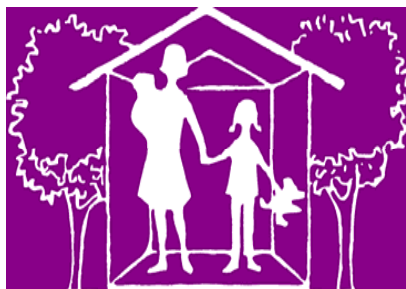
LOUDOUN ABUSED WOMEN SHELTER